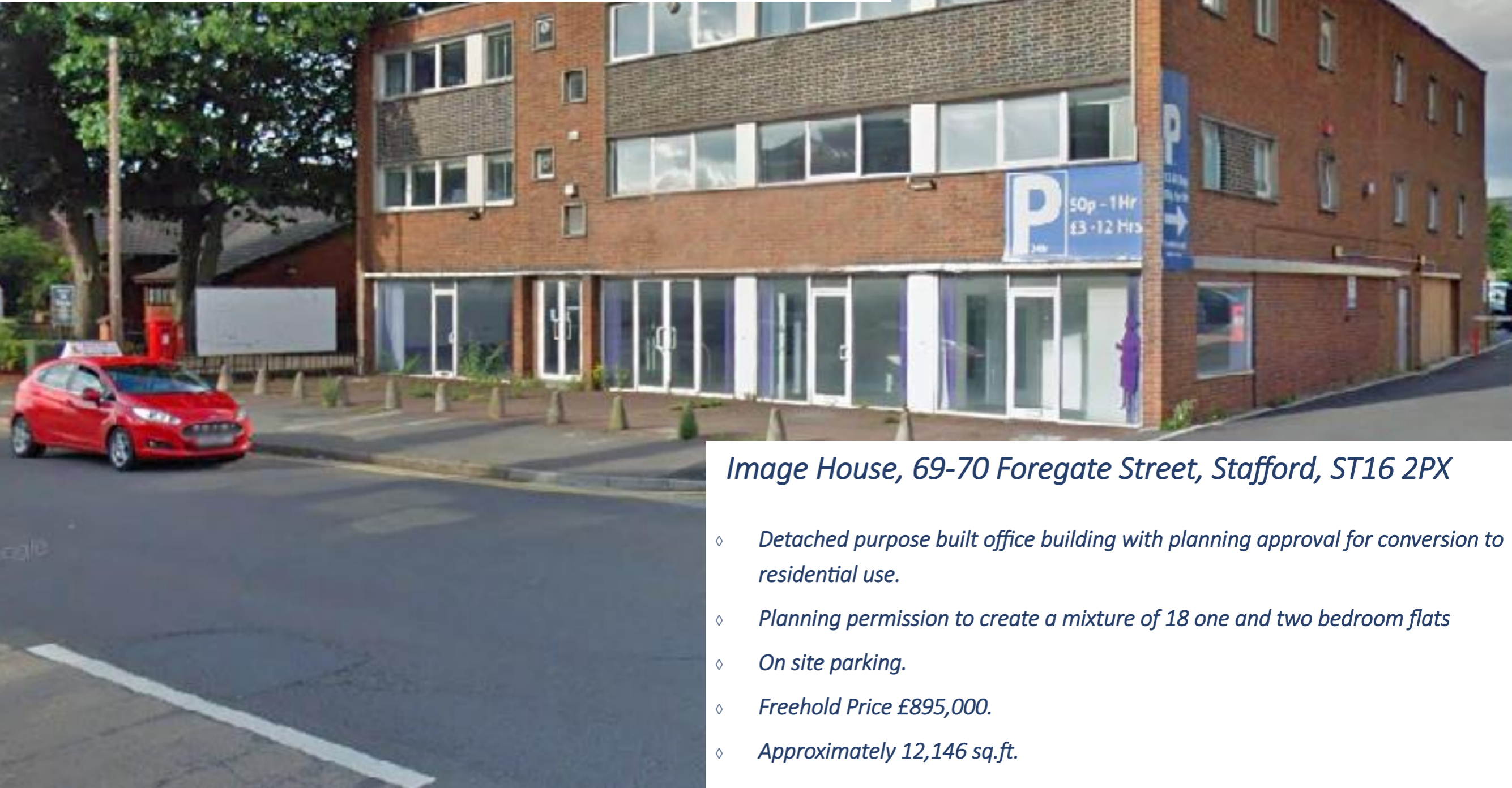
Image House, 69-70 Foregate Street, Stafford, ST16 2PX